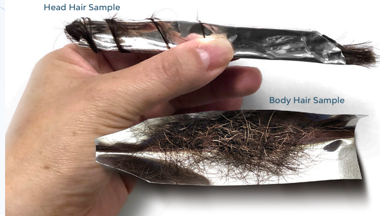
Body Hair Sample