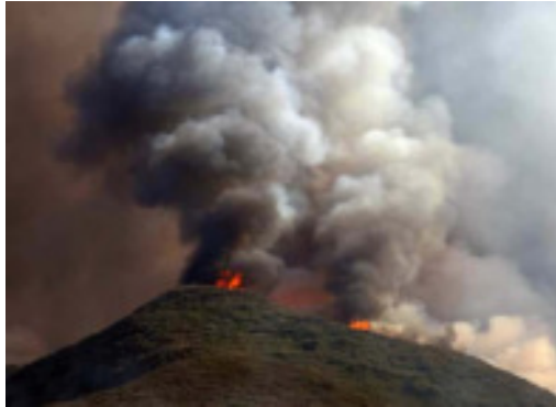
A drug camp is believed to have sparked the fire that burned 88,000 acres in California's Los Padres National Forest.

Illegal marijuana growers (many are believed to be affiliated with Mexican drug cartels) are aggressively expanding their farming operations in the U.S., clearing land to plant pot in national forests from coast to coast. Authorities have discovered pot farms in 61 national forests in 16 states this year, which is up from 49 forests in 10 states last year.