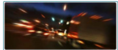
Commonly Detected Drugs of Nighttime Drivers

Oral fluid and blood samples have very short detection windows – typically 12 to 36 hours depending on the type of drug ingested. If a different testing technology (such as hair testing) had been used, the positive rates may have been much higher.