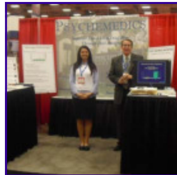
Psychemedics recently exhibited at the ASIS Conference in Dallas, Texas. ASIS is the largest conference for the security industry.